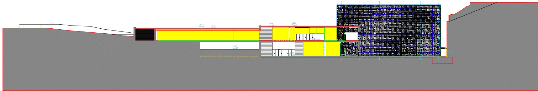
4 ALZADO EXTERIOR DE LA FACHADA DE ZINC SURESTE